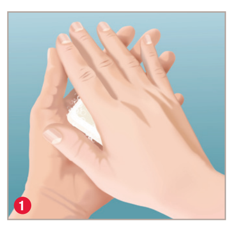
Wash hands with mild soap and water.