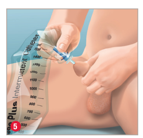
With one hand, hold the penis in an upward position at the base of the glans. With the other hand, grasp the catheter below the base of the protective tip and insert the protective tip into the urethral opening. Advance the catheter until urine starts to flow.