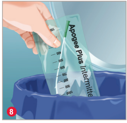
The catheter may be disposed of in a waste bin. DO NOT FLUSH DOWN TOILET. Wash hands with mild soap and water.