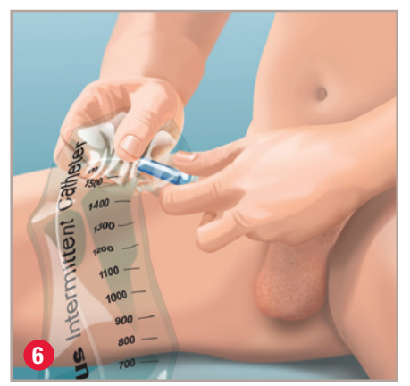
When the urine flow stops, slowly pull the catheter out to capture any urine remaining in the bladder.