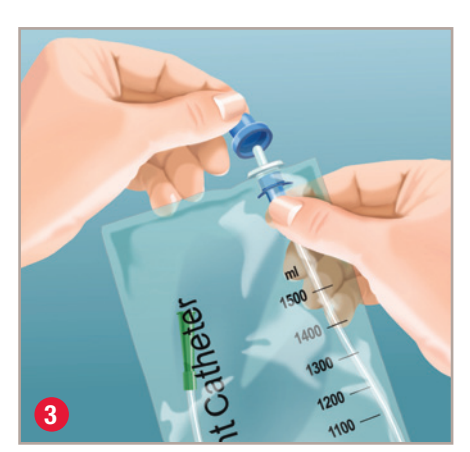
Remove the blue cap from the protective tip of the catheter. Advance the catheter into the protective tip. Do not advance the catheter past the end of the protective tip.