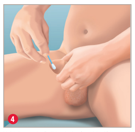
Hold the penis. Pull back the foreskin (if present) and cleanse around the opening of the urethra and then the glans with mild, unscented soap or a non-alcoholic wet wipe. If you are using the Apogee Plus kit, use the PVP swabs provided for cleansing.