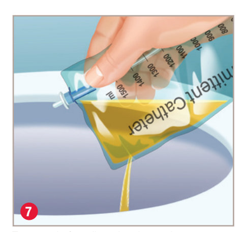
To empty before disposing the product, tear the bag at the perforation and pour urine into a toilet or other collection device.