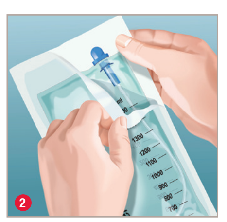
Fully fold back the packaging by peeling down on the clear side of the package.