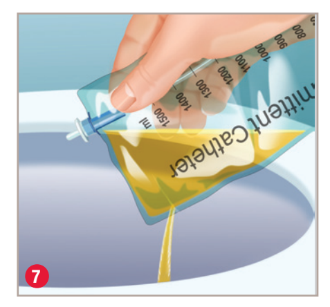
To empty before disposing the product, tear the bag at the perforation and pour urine into a toilet or other collection device.