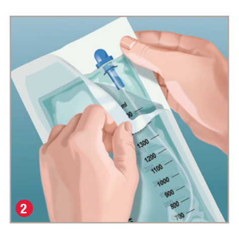
Fully fold back the packaging by peeling down on the clear side of the package.