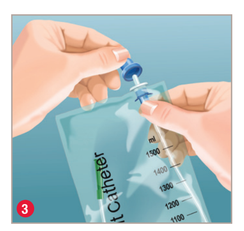
Remove the blue cap from the protective tip of the catheter. Advance the catheter into the protective tip. Do not advance the catheter past the end of the protective tip.