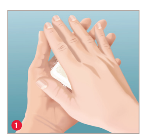
Wash hands with mild soap and water.