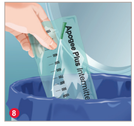
The catheter may be disposed of in a waste bin. DO NOT FLUSH DOWN TOILET. Wash hands with mild soap and water.