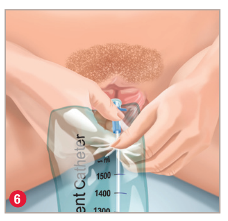
When the urine flow stops, slowly pull the catheter out to capture any urine remaining in the bladder.